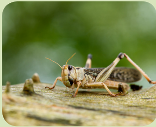
Animal on Tree