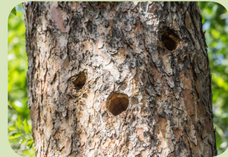
Hole in Trunk or Base of Tree