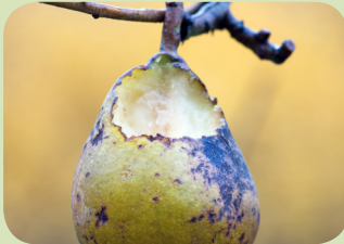
Bite Marks on Nut or Fruit