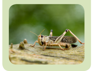
Animal on Tree