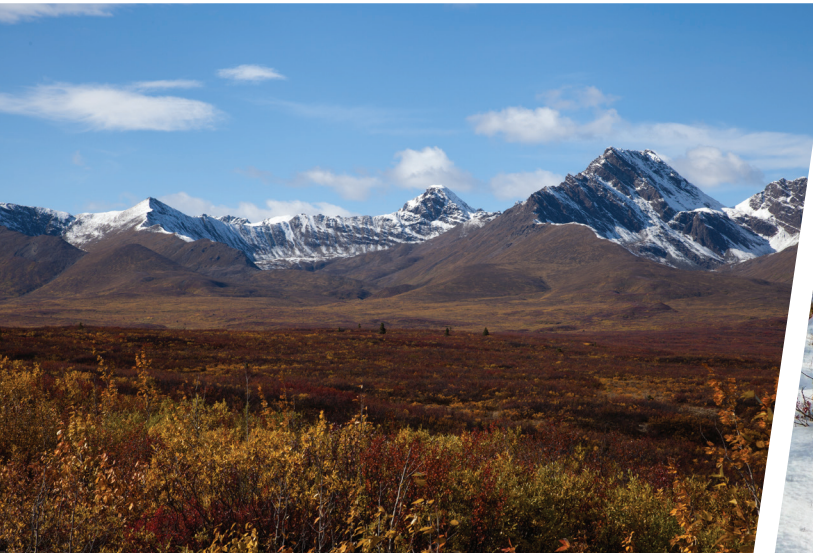
Tundra in spring